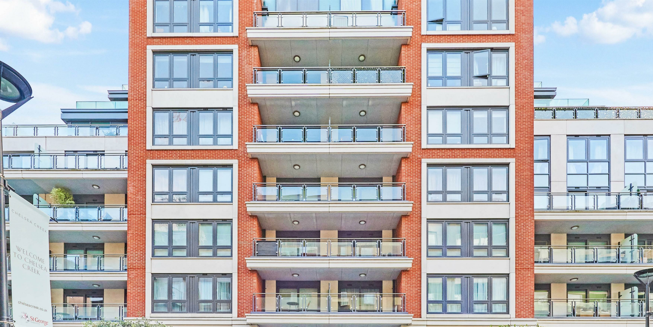
Compass House, Chelsea Creek Fulham SW6